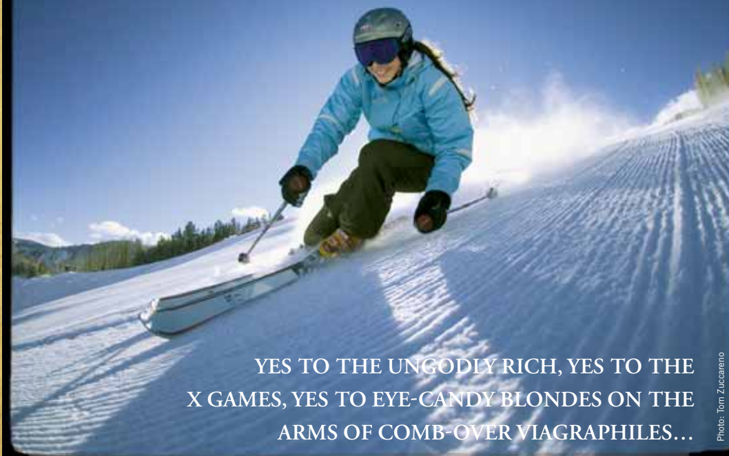
Thundering down Thunderbowl on Aspen Highlands